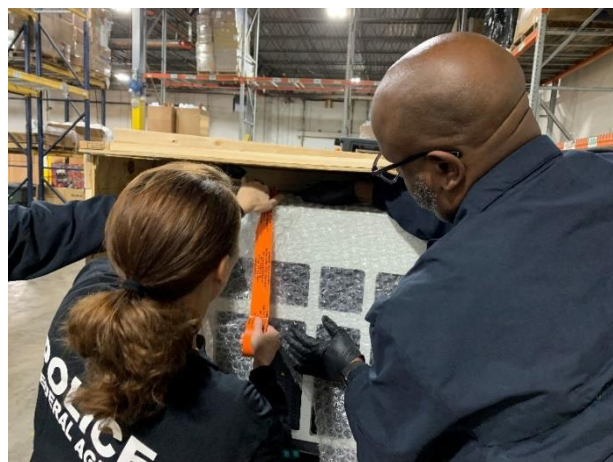
OEE Special Agents effecting a detention