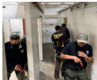
OEE Special Agents participating in a tactical training exercise