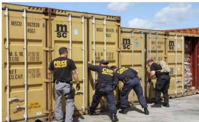
OEE Special Agents conducting an inspection

Fast-forward to the aftermath of September 11, 2001, and the focus of our country’s national security efforts pivoted to face a new and pressing threat of the terrorist attacks on our homeland by non-state actors like al-Qaeda. The changing nature of the threat meant OEE, in addition to investigating the proliferation of WMD and destabilizing military activities, also worked more closely with the Department of Defense to prevent U.S. components from getting into the hands of terrorists for use in improvised explosive devices. In parallel, we expanded the use of our Entity List to allow for the designation of parties when supporting any activity contrary to U.S. national security or foreign policy interests.